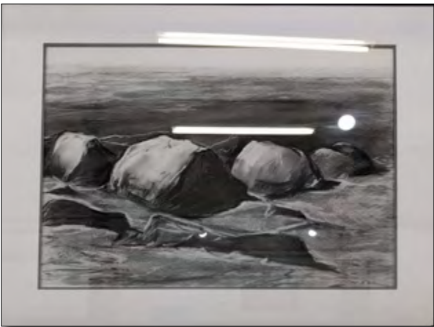
Best Drawing: Susan Hall (Charcoal)