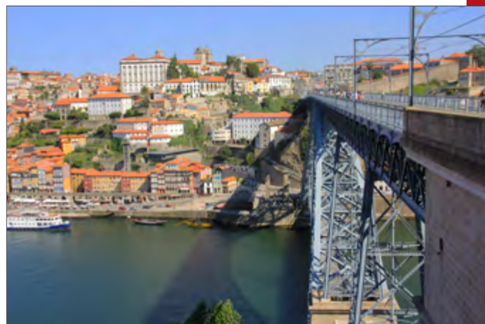
Leading Lines