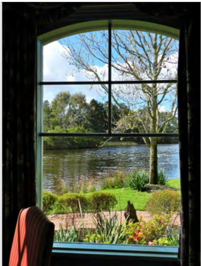
Natural Framing