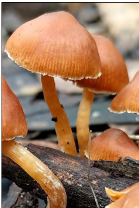
Best Colour Photograph: Jenny McDonald