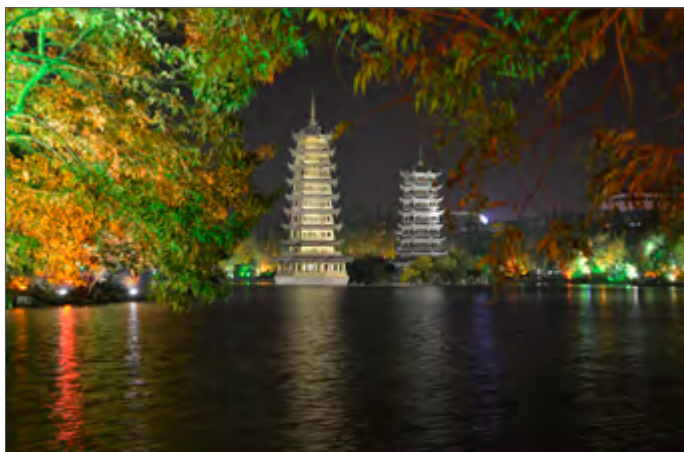
Natural Framing