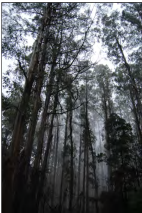
Best B & W Photograph: Barbara Cumming