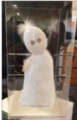
3rd Prize: "Shamanic Figure" Meg Viney