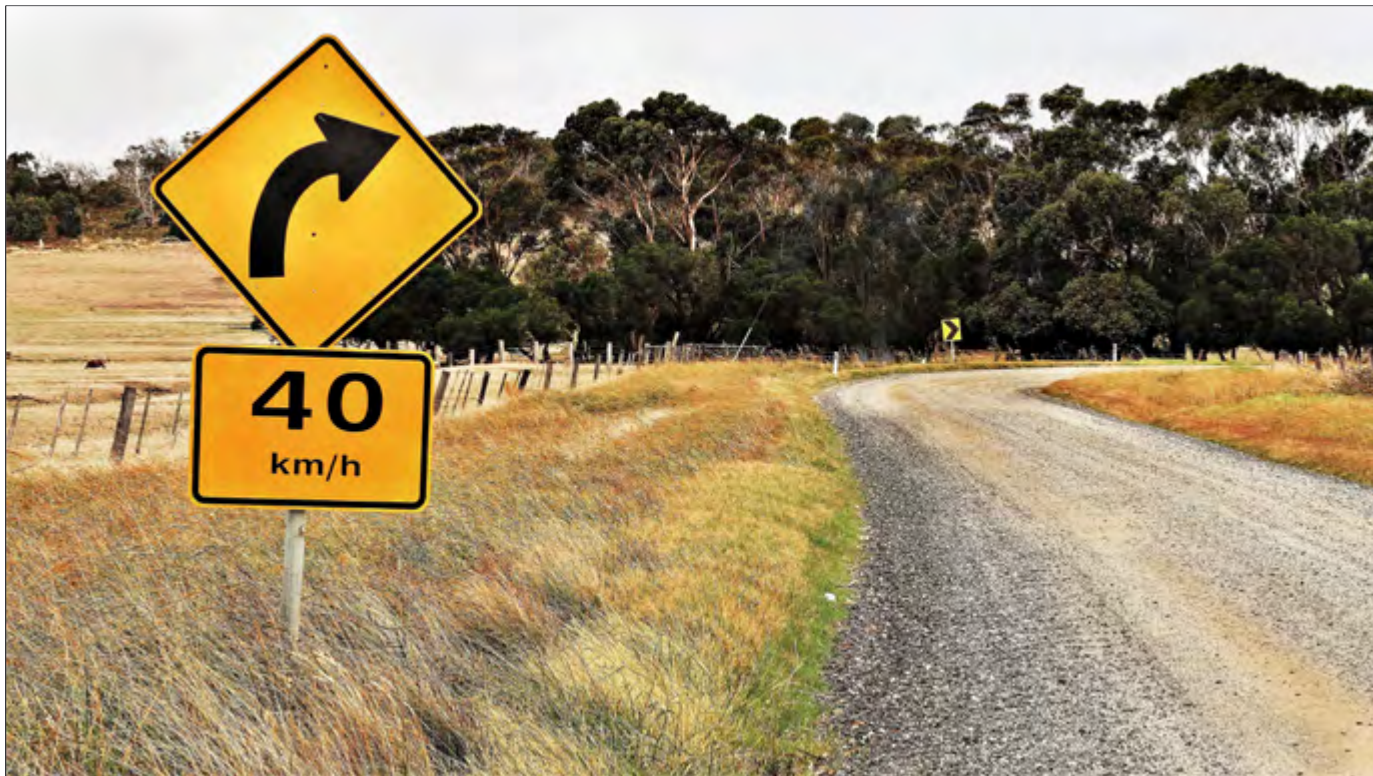
Leading Lines