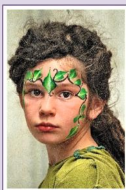
Imp - Canon EOS 80D f/6.3, 1/30s, ISO-800, 250mm