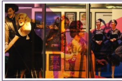
Member Photo – © Ian Mayer Olympus E-M5MarkII f/6.3, 1/2s, ISO-1000, 150 mm

We headed north on Graham Street to photograph the theatre and took some shots of the reflections on the road from the pizza shop neon signs where a sudden wind gust threatened to topple our tripods.. The night finished with a drink and a friendly chat on the couches at the Workman's Club. A very relaxing end to a fun outing.