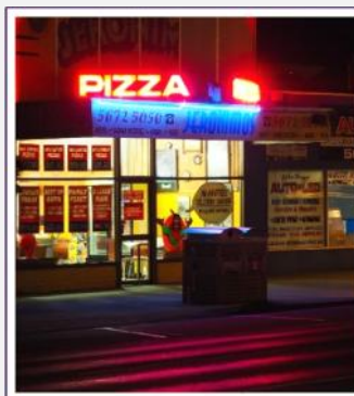
Olympus E-M5MarkII f/9, 0.8s, ISO-1000, 60 mm