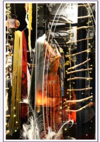
Member Photo © Murray Fox Edited in Affinity

Heritage buildings were our first photo walk subjects – the old Railway Building (the Museum), the Whalebone Hotel (Taberner's) and the Book Exchange (the heritage bank building.) We moved on to neon signs and artistic shop windows. Then we practised a starburst light effect using the street light by the Cally (Caledonian Hotel).