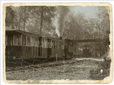
Photo edited in free Photoscape – converted to sepia and with an antique photo filter applied

There will be food and drink trucks at the site.