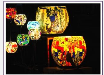
Member Photo – © Ian Mayer Olympus E-M5MarkII f/22, 1s, ISO-200, 90 mm