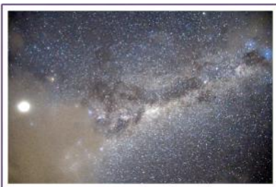
The Emu – head and body Nikon D7500 & Tamron 18-400mm f/3.5, 20s, ISO-6400, 18mm Edited In Photoscape 3.7