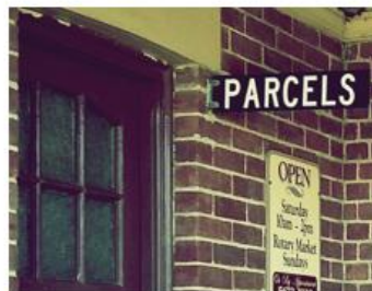
Film effect - Agfa