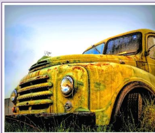
Austin - Canon EOS 80D 24mm - Edited in Picasa