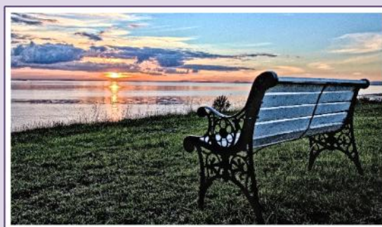
Jam Jerrup Sunset