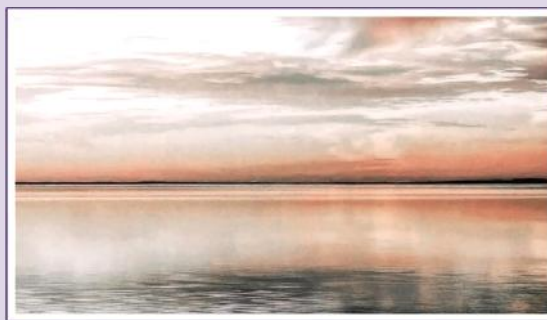
Sunset over Westernport Canon EOS 80D, f/9, 1/8s, ISO-100, 105mm - Edited in Paintshop Pro