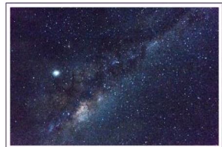
Member Photo © Kerryyn Dunlop Canon EOS 60D, f/4, 30s, ISO-3200, 18mm Edited in Adobe Photoshop