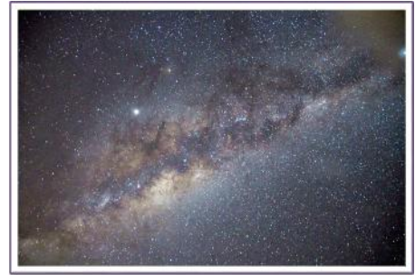
Nikon D7500 f/3.5, 20s, ISO-5000, 18mm, Edited in Photoscape 3.7

Then to our delight the clouds finally cleared and there was the Milky Way in all her splendor. We were oblivious to the cold as we photographed both the Milky Way core and the emu's head at the other end. We were fortunate to have a dark night and to get our photos in before the moon rose at around 9.30.