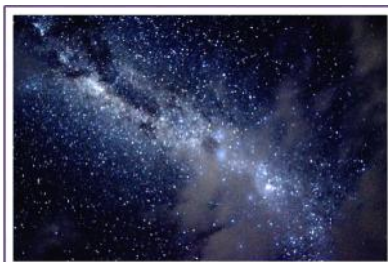
Member Photo Nikon D7000, Edited in Nikon View NX2