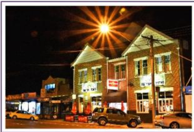
Nikon D7500 Tamron 18-400mm f/20 (for the starburst), 2 sec, ISO-720, 22mm Cropped and edited in Photoscape