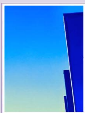
Wonthaggi Mitre10, Panasonic DMC-FZ20 f/5.2, 1/500s, ISO-80m, 24mm