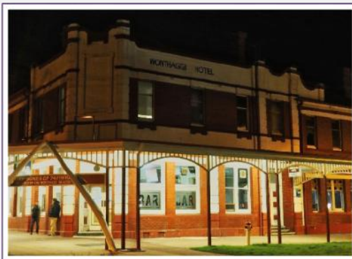
Member Photo – © Ian Mayer Olympus E-M5MarkII f/16, 2s, ISO-1600, -0.3step, 17 mm

We headed north on Graham Street to photograph the theatre and took some shots of the reflections on the road from the pizza shop neon signs where a sudden wind gust threatened to topple our tripods.. The night finished with a drink and a friendly chat on the couches at the Workman's Club. A very relaxing end to a fun outing.