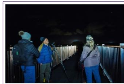
Members with their eyes and cameras pointed to the sky on the June 22 nd Milky Way Experience Canon EOS 60D, f/4, 10s, ISO-3200, 18mm