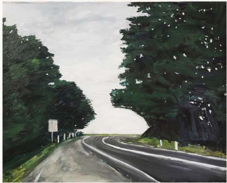
Carrie Kennedy 7, Road near Fish Creek 2019 Oil on board 42 x 62cm