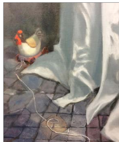
Detail from one of the "Infinite Birdcage Series".