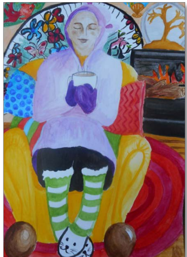
Coffee! The cure for crooked ears in the morning.