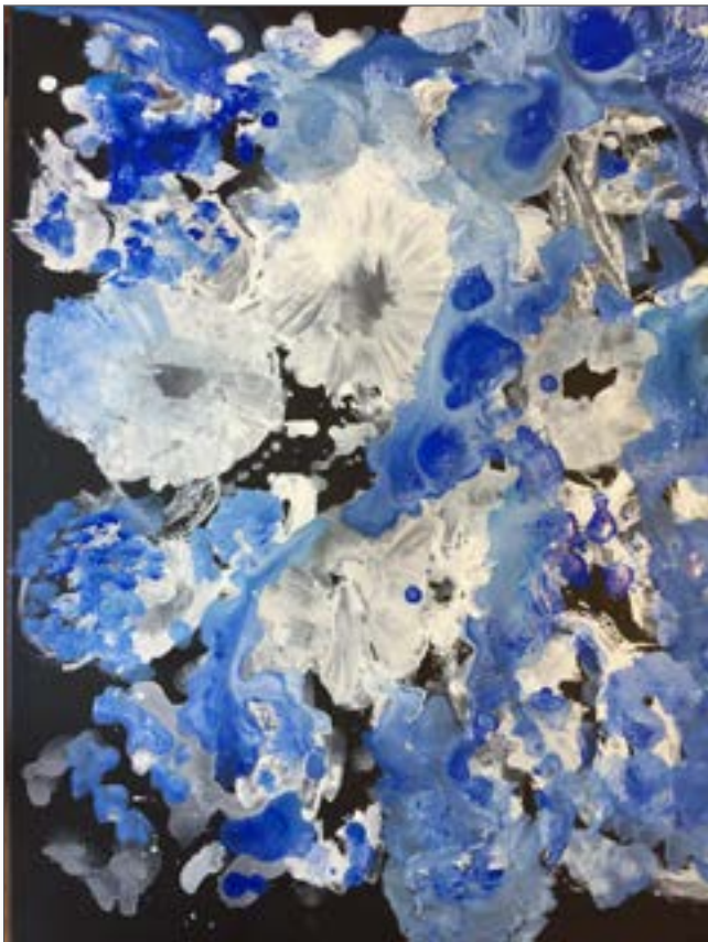
Blue Stream: Hazel Zander