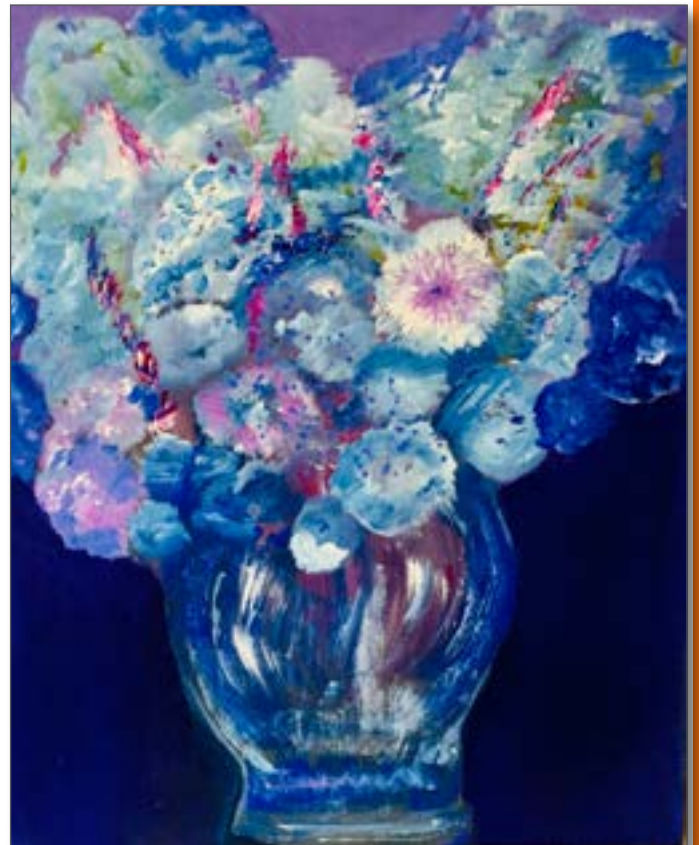
Vase of Flowers: Hazel Zander