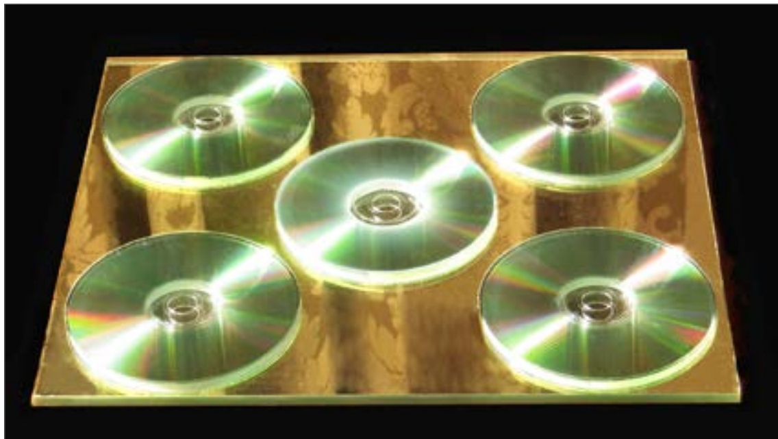
Spectrum 4: Trevor Allan