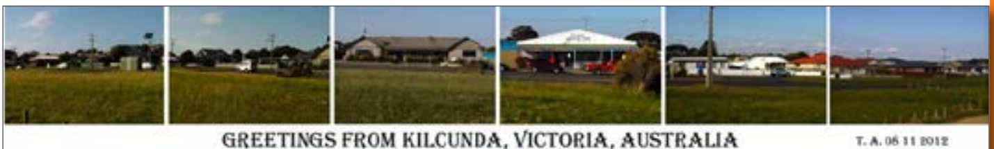
Kilcunda: Trevor Allan

Below and following page are compilations done for banners that Trevor put together... Interesting, Wonthaggi is shown as a place with quiet empty streets as it may be seen again in the coming days. Prophetic indeed Trevor.