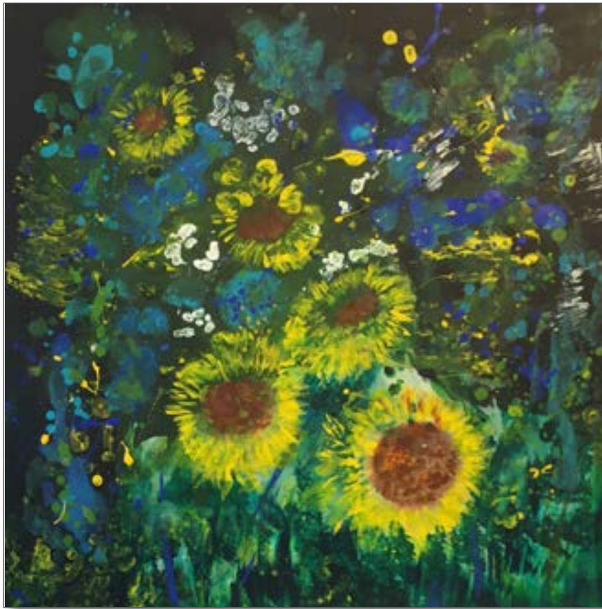
Sunflowers: Hazel Zander