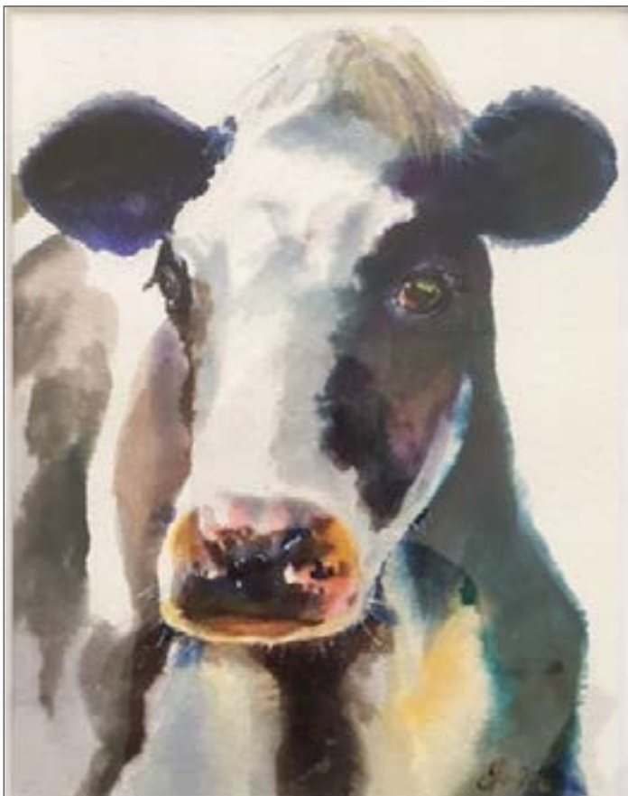
Cowgirl of Colour: Ellen Hubble