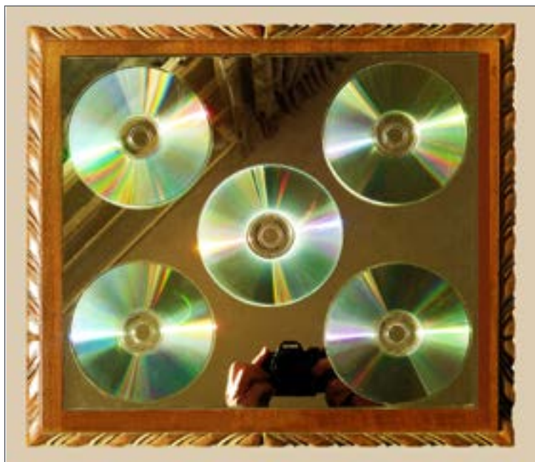
Spectrum 2: Trevor Allan

"I noticed the effect the sun had when shining on computer discs which were on a side table in my house and made a few compositions which included placing the discs on a mirror."