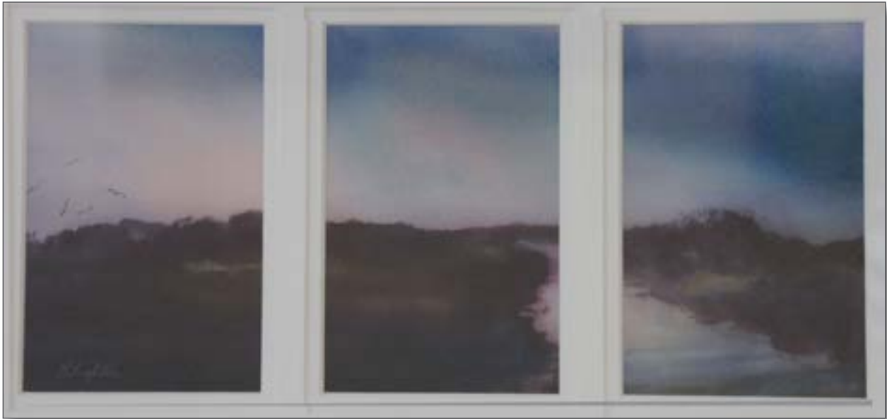
When Night Fall: Ellen Hubble

Well done Ellen Hubble on your win and Honourable mention at the Inverloch Art Show.